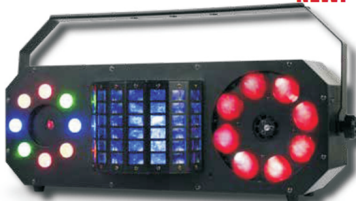
BOOM BOX FX 2